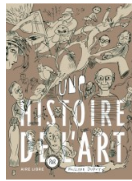
Une histoire de l'art