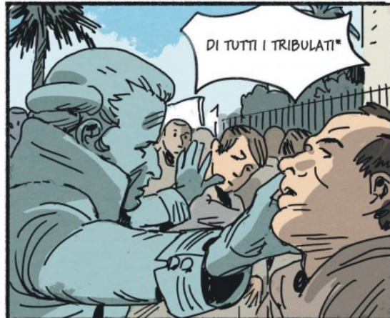
* DE TOUS LES TOURMENTÉS