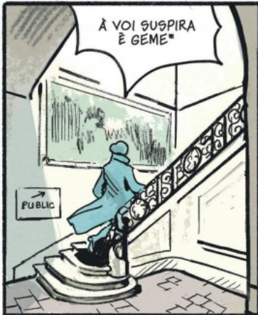
* VERS VOUS GOUPIRE ET GÈME