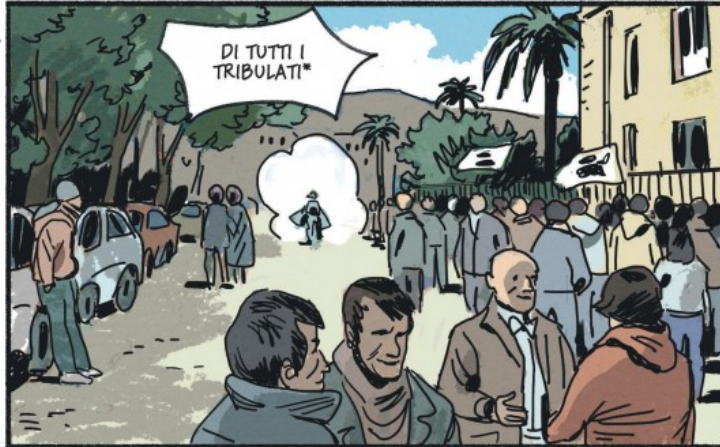
* DE TOUS LES TOURMENTÉS