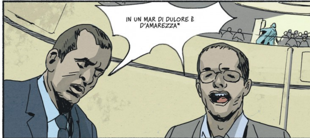
* DANS UNE MER DE DOULEUR ET D'AMERTUME