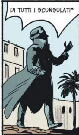
* DE TOUS LES ATTRISTÉS