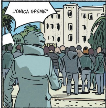
* L'UNIQUE ESPÉRANCE