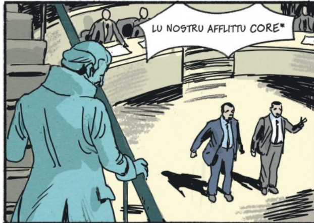
* NOTRE COEUR AFFLIGÉ