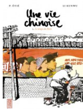
Une vie chinoise T2