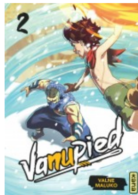
Vanupied - tome 2