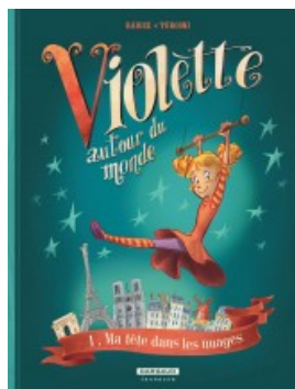
Ma tête dans les nuages