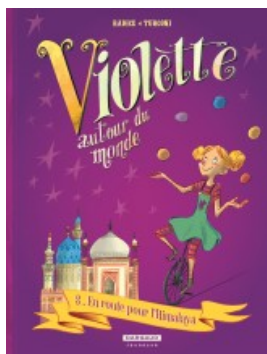
En route pour l'Himalaya