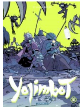
Yojimbot - Tome 2