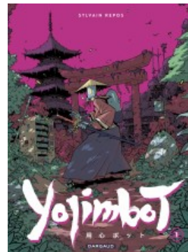
Yojimbot - Tome 1