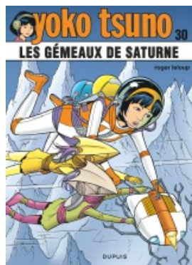
Les gémeaux de saturne