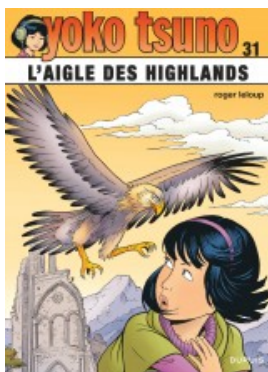
L'aigle des Highlands