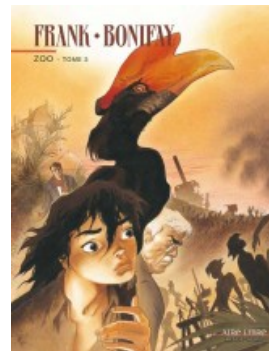
Zoo tome 3