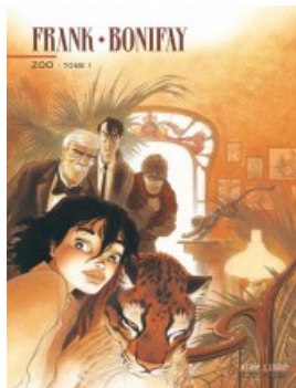
Zoo tome 1